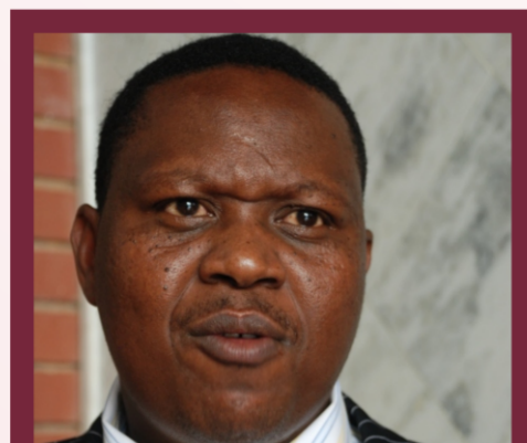
Hon. Victor Kheswa COPE Whip