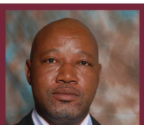
Hon. Raymond Elisha Chairperson of Chairpersons (ANC)