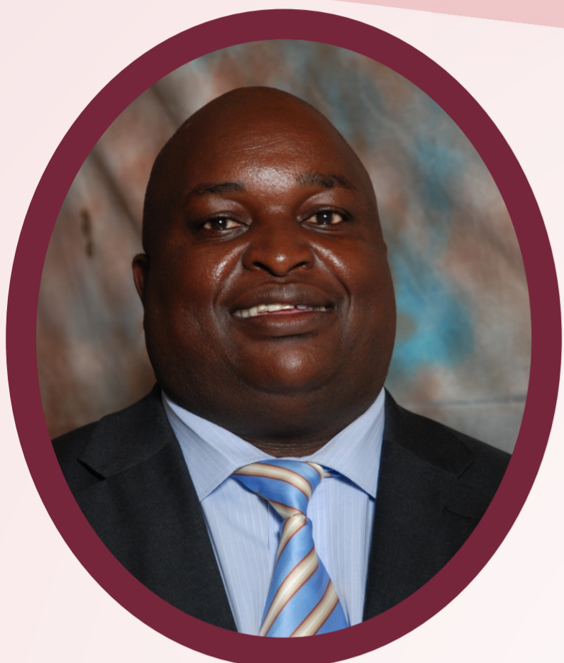
Hon. Dodo Baloyi (ANC) Chief Whip of NWPL Chairperson