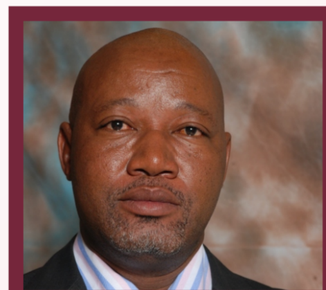
Hon. Raymond Elisha (ANC) Chairperson of chairpersons